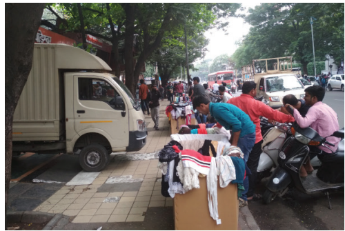
Hawkers are causing inconvenience at Ghole Road