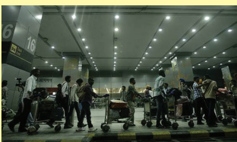
People waiting for their boarding passes at Pune airport

An official at the authority says, "With number of flights increasing at the Pune airport, it is difficult to manage the crowd during peak hours. For example, if someone's flight is at