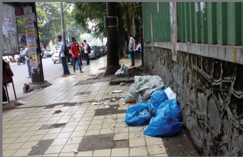
Garbage lying unattended at Pune's busiest street F C footpath.