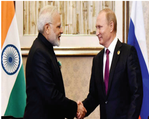
Prime Minister Narendra Modi and Russian President Vladimir Putin at the Indo-Russian summit