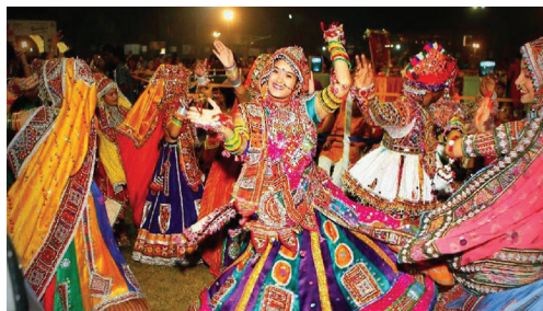
Dandiya Celebrations to begin from October 10

Many of the events are organised for a social cause. The Rotaract Club of Chinchwad is organising the 'The Great Indian Navratri' where the fees collected for tickets will be given for funding the education of street children. Similarly, Creativity conducts 'The Yellow Ribbon Fair' for the cause of encouraging handmade tribal articles.