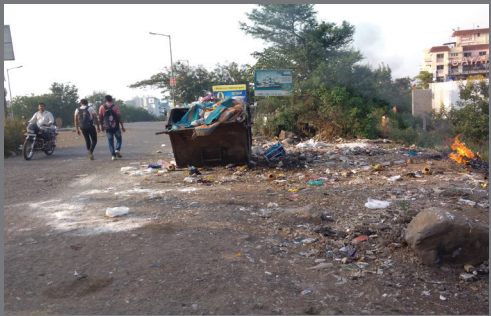
Garbage spilling in Bhosari showing the lack of seriousness among PCMC officials .

Swachha Bharat is a flagship program of the government and we are celebrating the 150 th anniversary of Gandhi ji though the current state of affairs of pUne has a different